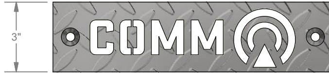
PLAN VIEW (COMMUNICATION TAG)